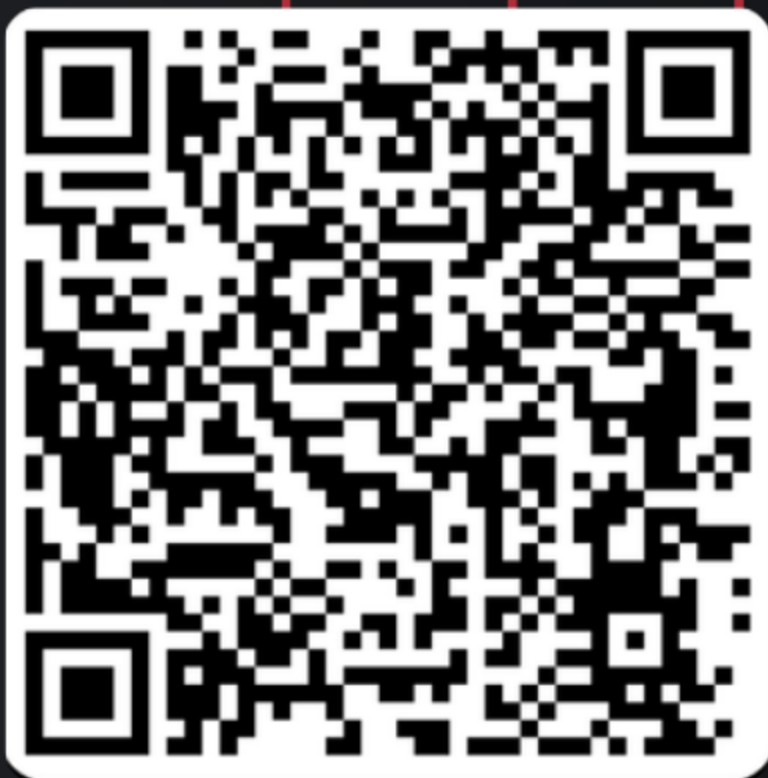
We recommend the use of subtitles

By deepfake we mean any photos and videos that are generated completely by an AI. One of its uses may be identity theft.